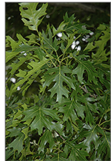
Shumard Oak foliage