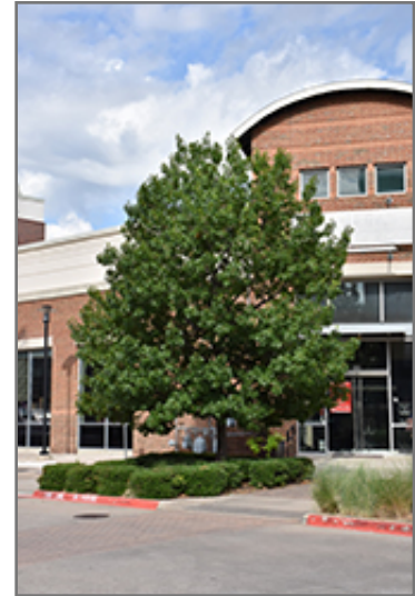
Shumard Oak