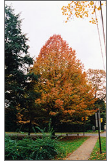
Shumard Oak in fall

This tree should only be grown in full sunlight. It is an amazingly adaptable plant, tolerating both dry conditions and even some standing water. It is considered to be drought-tolerant, and thus makes an ideal choice for xeriscaping or the moisture-conserving landscape. It is not particular as to soil type, but has a definite preference for acidic soils, and is subject to chlorosis (yellowing) of the foliage in alkaline soils. It is somewhat tolerant of urban pollution. This species is native to parts of North America.