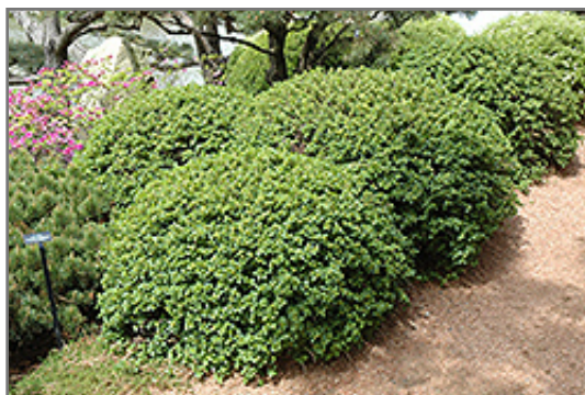
Green Mound Alpine Currant