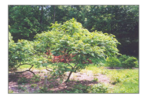
Cutleaf Smooth Sumac