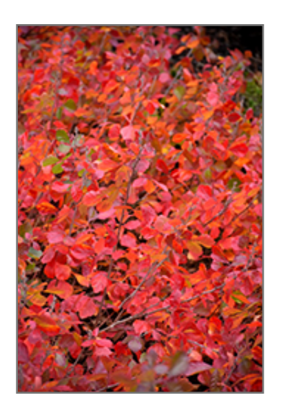
Gro-Low Fragrant Sumac in fall