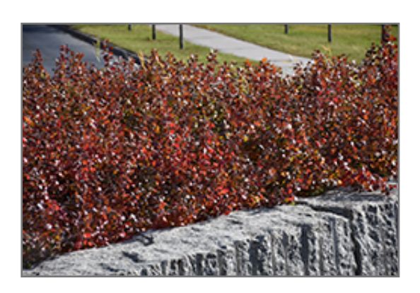
Gro-Low Fragrant Sumac in fall

This shrub performs well in both full sun and full shade. It is very adaptable to both dry and moist locations, and should do just fine under typical garden conditions. It is not particular as to soil type, but has a definite preference for acidic soils, and is subject to chlorosis (yellowing) of the foliage in alkaline soils. It is highly tolerant of urban pollution and will even thrive in inner city environments. Consider applying a thick mulch around the root zone in winter to protect it in exposed locations or colder microclimates. This is a selection of a native North American species.