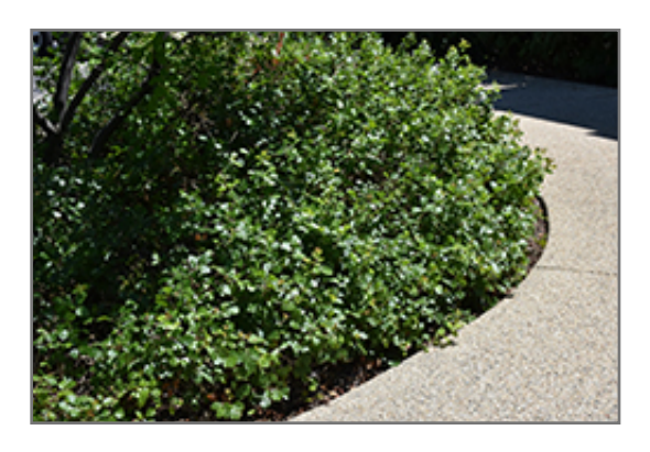
Gro-Low Fragrant Sumac

Gro-Low Fragrant Sumac is recommended for the following landscape applications;