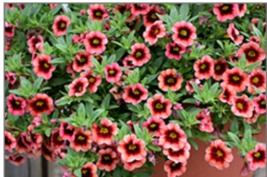
Superbells Coralberry Punch Calibrachoa flowers