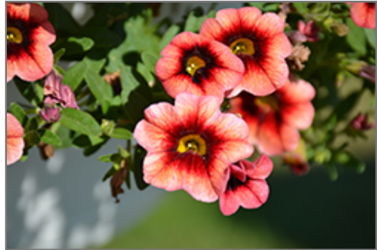
Superbells Coralberry Punch Calibrachoa flowers

Superbells Coralberry Punch Calibrachoa is a dense herbaceous annual with a trailing habit of growth, eventually spilling over the edges of hanging baskets and containers. Its medium texture blends into the garden, but can always be balanced by a couple of finer or coarser plants for an effective composition.