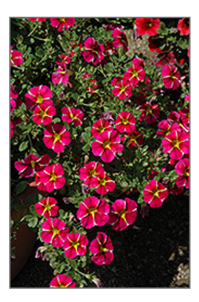
Superbells Cherry Star Calibrachoa flowers