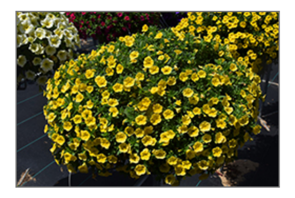
Cabaret Yellow Calibrachoa in bloom

This plant will require occasional maintenance and upkeep. Trim off the flower heads after they fade and die to encourage more blooms late into the season. It is a good choice for attracting bees and hummingbirds to your yard, but is not particularly attractive to deer who tend to leave it alone in favor of tastier treats. It has no significant negative characteristics.