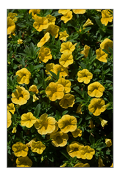
Cabaret Yellow Calibrachoa flowers

Cabaret Yellow Calibrachoa is a dense herbaceous annual with a trailing habit of growth, eventually spilling over the edges of hanging baskets and containers. Its medium texture blends into the garden, but can always be balanced by a couple of finer or coarser plants for an effective composition.