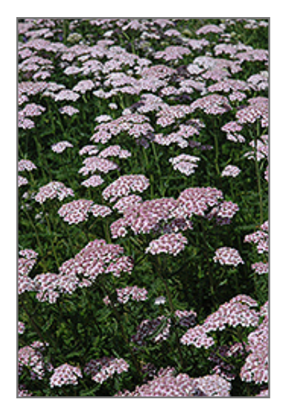
Lavender Deb Yarrow flowers

Lavender Deb Yarrow is recommended for the following landscape applications;