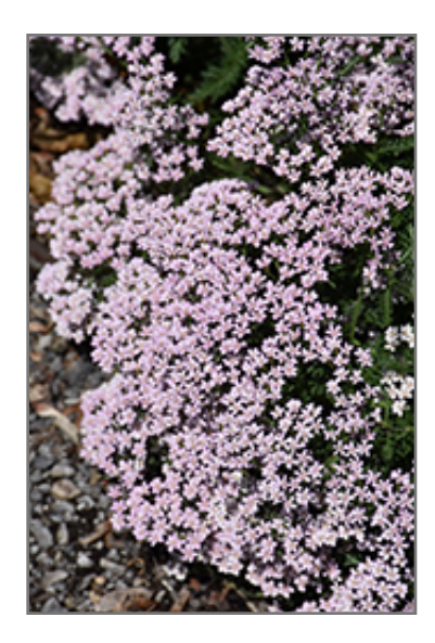
Lavender Deb Yarrow flowers