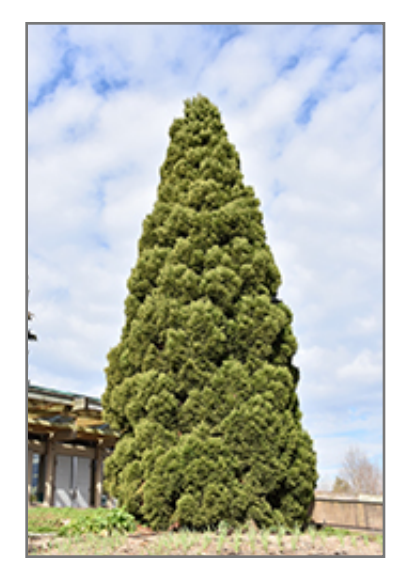
Japanese Cedar