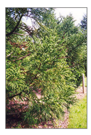
Japanese Cedar foliage