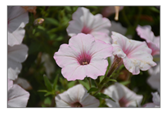
Supertunia Vista Silverberry Petunia flowers

Supertunia Vista Silverberry Petunia is recommended for the following landscape applications;