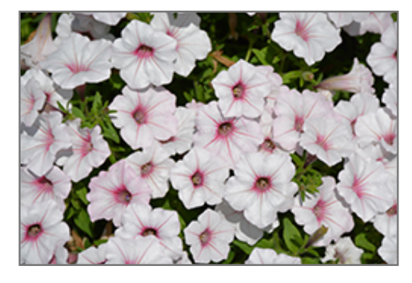
Supertunia Vista Silverberry Petunia flowers

This plant will require occasional maintenance and upkeep. Trim off the flower heads after they fade and die to encourage more blooms late into the season. It is a good choice for attracting butterflies and hummingbirds to your yard, but is not particularly attractive to deer who tend to leave it alone in favor of tastier treats. It has no significant negative characteristics.