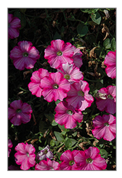
Supertunia Raspberry Blast Petunia flowers

Supertunia Raspberry Blast Petunia is blanketed in stunning shell pink trumpet-shaped flowers with hot pink edges at the ends of the stems from mid spring to mid fall. Its pointy leaves remain green in colour throughout the season.