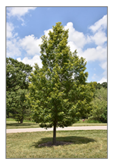
Sawtooth Oak

This tree will require occasional maintenance and upkeep, and is best pruned in late winter once the threat of extreme cold has passed. It is a good choice for attracting squirrels to your yard. Gardeners should be aware of the following characteristic(s) that may warrant special consideration;