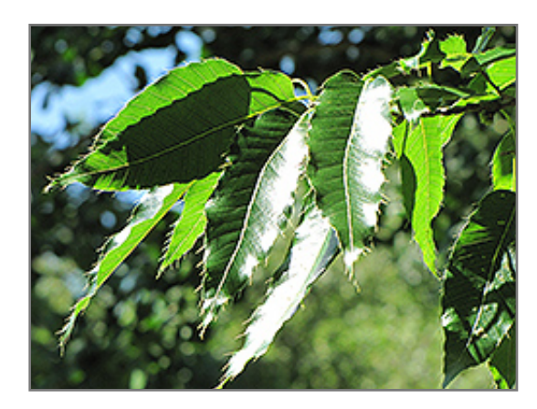
Sawtooth Oak foliage