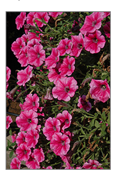
Supertunia Mini Strawberry Pink Vein Petunia flowers

Supertunia Mini Strawberry Pink Vein Petunia is recommended for the following landscape applications;