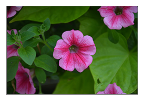
Supertunia Mini Strawberry Pink Vein Petunia flowers

This plant will require occasional maintenance and upkeep. Trim off the flower heads after they fade and die to encourage more blooms late into the season. It is a good choice for attracting butterflies and hummingbirds to your yard, but is not particularly attractive to deer who tend to leave it alone in favor of tastier treats. It has no significant negative characteristics.