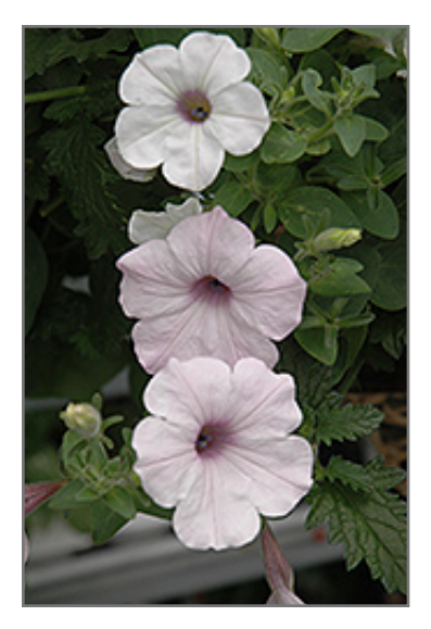
Supertunia Mini Silver Petunia flowers