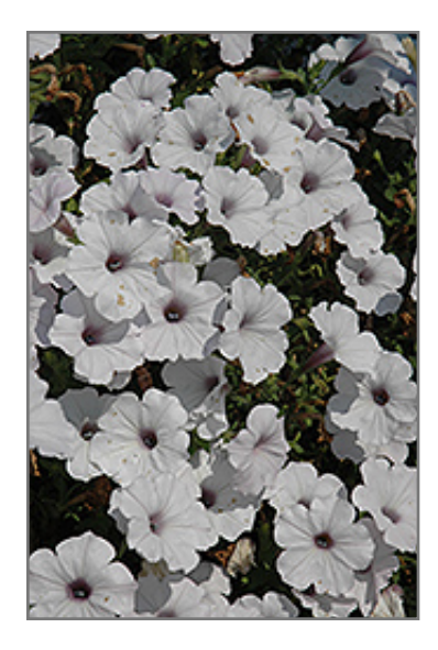
Supertunia Mini Silver Petunia flowers