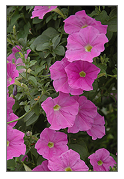
Supertunia Lavender Skies Petunia flowers

Supertunia Lavender Skies Petunia is smothered in stunning lavender trumpet-shaped flowers at the ends of the stems from mid spring to mid fall. Its pointy leaves remain green in colour throughout the season.