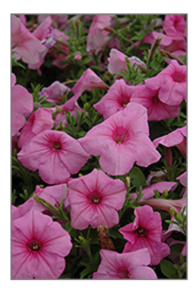
Supertunia Cotton Candy Petunia flowers