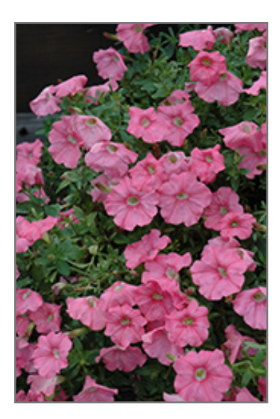
Supertunia Bermuda Beach Petunia flowers