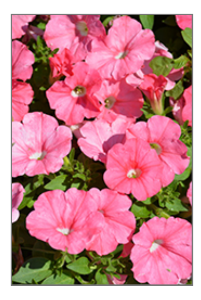
Supertunia Bermuda Beach Petunia flowers