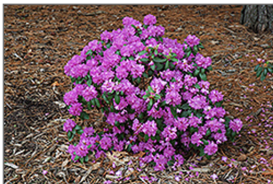
Compact P.J.M. Rhododendron in bloom