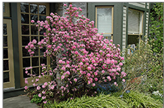
Olga Mezitt Rhododendron in bloom