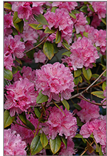
Olga Mezitt Rhododendron flowers