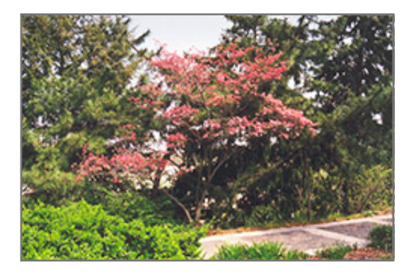
Red Giant Flowering Dogwood in bloom

This is a relatively low maintenance tree, and should only be pruned after flowering to avoid removing any of the current season's flowers. It is a good choice for attracting birds to your yard. Gardeners should be aware of the following characteristic(s) that may warrant special consideration;