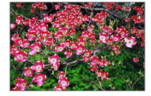
Red Giant Flowering Dogwood flowers

Red Giant Flowering Dogwood is a multi-stemmed deciduous tree with a stunning habit of growth which features almost oriental horizontally-tiered branches. Its average texture blends into the landscape, but can be balanced by one or two finer or coarser trees or shrubs for an effective composition.