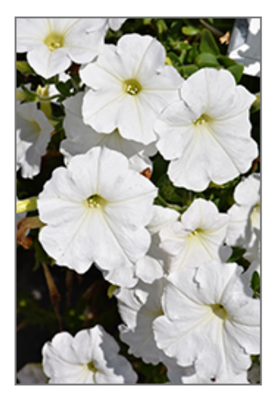
Easy Wave White Petunia flowers

Easy Wave White Petunia is a dense herbaceous annual with a trailing habit of growth, eventually spilling over the edges of hanging baskets and containers. Its medium texture blends into the garden, but can always be balanced by a couple of finer or coarser plants for an effective composition.