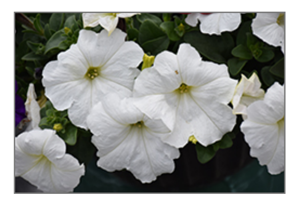
Easy Wave White Petunia flowers