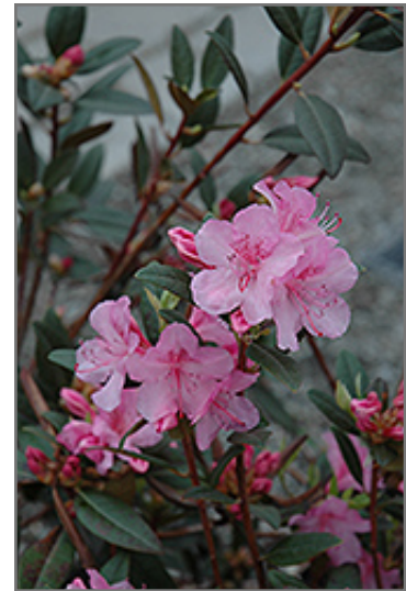
Aglo Rhododendron flowers

Aglo Rhododendron will grow to be about 3 feet tall at maturity, with a spread of 3 feet. It has a low canopy. It grows at a slow rate, and under ideal conditions can be expected to live for 40 years or more.