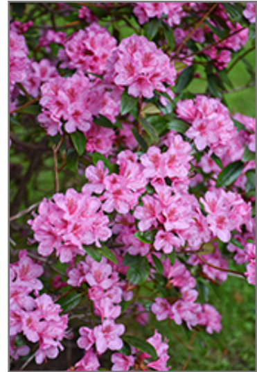
Aglo Rhododendron flowers

Aglo Rhododendron makes a fine choice for the outdoor landscape, but it is also well-suited for use in outdoor pots and containers. Because of its height, it is often used as a 'thriller' in the 'spiller-thriller-filler' container combination; plant it near the center of the pot, surrounded by smaller plants and those that spill over the edges. It is even sizeable enough that it can be grown alone in a suitable container. Note that when grown in a container, it may not perform exactly as indicated on the tag - this is to be expected. Also note that when growing plants in outdoor containers and baskets, they may require more frequent waterings than they would in the yard or garden. Be aware that in our climate, most plants cannot be expected to survive the winter if left in containers outdoors, and this plant is no exception. Contact our experts for more information on how to protect it over the winter months.