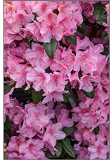
Aglo Rhododendron flowers