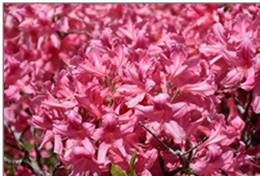
Rosy Lights Azalea flowers

Rosy Lights Azalea is recommended for the following landscape applications;