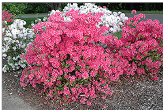
Rosy Lights Azalea in bloom