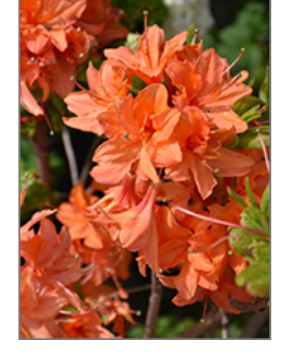
Mandarin Lights Azalea flowers

This is a relatively low maintenance shrub, and should only be pruned after flowering to avoid removing any of the current season's flowers. It has no significant negative characteristics.