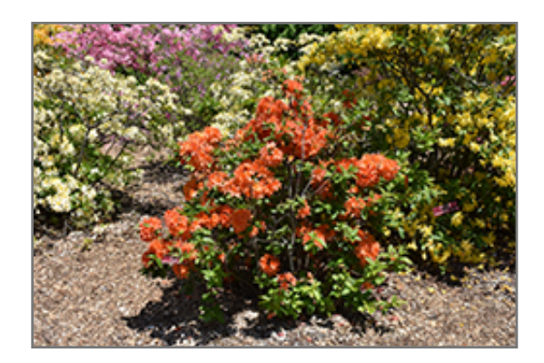
Mandarin Lights Azalea in bloom

Mandarin Lights Azalea is recommended for the following landscape applications;