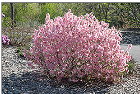
Cornell Pink Rhododendron in bloom