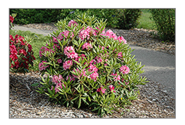
Haaga Rhododendron in bloom

Haaga Rhododendron is an open multi-stemmed evergreen shrub with an upright spreading habit of growth. Its relatively coarse texture can be used to stand it apart from other landscape plants with finer foliage.