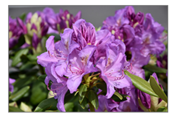
Boursault Rhododendron flowers