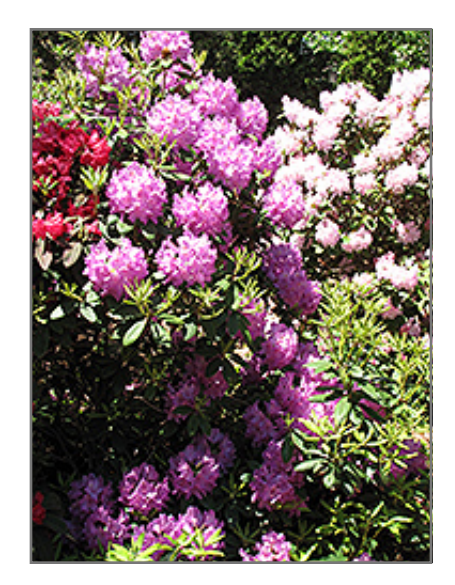
Boursault Rhododendron in bloom