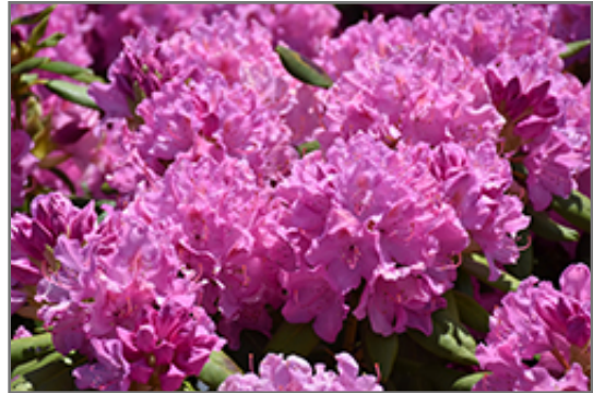
Roseum Elegans Rhododendron flowers

Roseum Elegans Rhododendron is recommended for the following landscape applications;