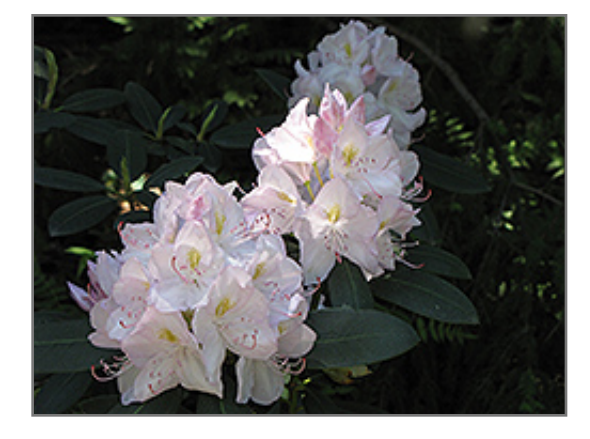
White Catawba Rhododendron flowers

White Catawba Rhododendron is a multi-stemmed evergreen shrub with an upright spreading habit of growth. Its relatively coarse texture can be used to stand it apart from other landscape plants with finer foliage.