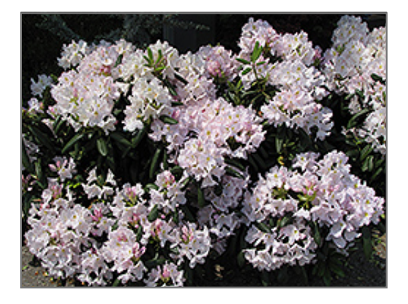
White Catawba Rhododendron in bloom

This is a relatively low maintenance shrub, and should only be pruned after flowering to avoid removing any of the current season's flowers. It has no significant negative characteristics.