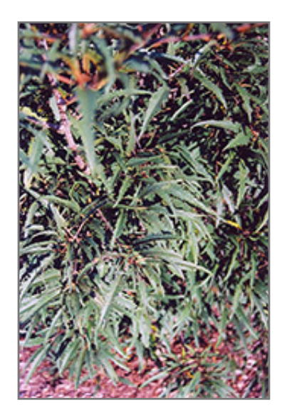
Cutleaf Glossy Buckthorn foliage