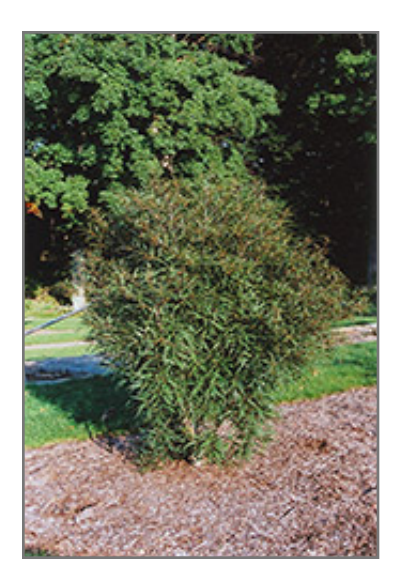
Cutleaf Glossy Buckthorn