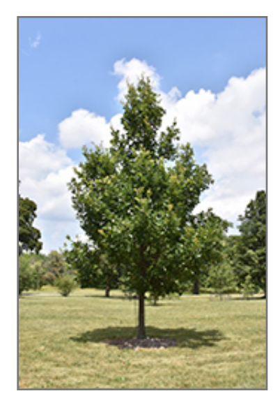
Heritage English Oak