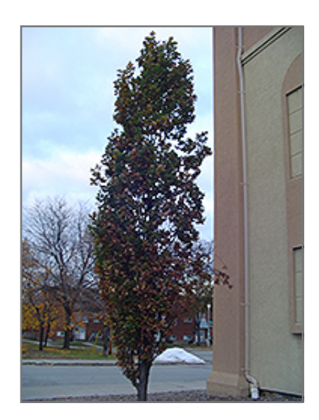
Pyramidal English Oak in fall