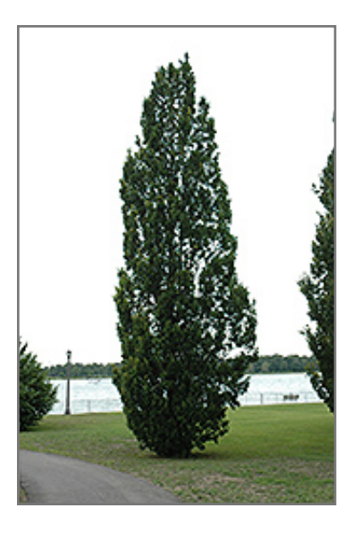
Pyramidal English Oak

Pyramidal English Oak is recommended for the following landscape applications;