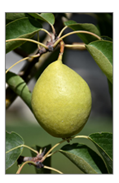
Early Gold Pear fruit

Early Gold Pear is draped in stunning clusters of white flowers with purple anthers along the branches in mid spring. It has dark green deciduous foliage. The glossy oval leaves turn an outstanding burgundy in the fall. The fruits are showy chartreuse pears with hints of gold, which are carried in abundance in early fall. The fruit can be messy if allowed to drop on the lawn or walkways, and may require occasional clean-up.