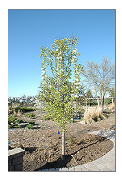
Summercrisp Pear in bloom