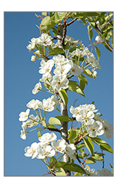
Summercrisp Pear flowers

This tree is typically grown in a designated area of the yard because of its mature size and spread. It should only be grown in full sunlight. It does best in average to evenly moist conditions, but will not tolerate standing water. It is not particular as to soil type or pH. It is highly tolerant of urban pollution and will even thrive in inner city environments. This particular variety is an interspecific hybrid.