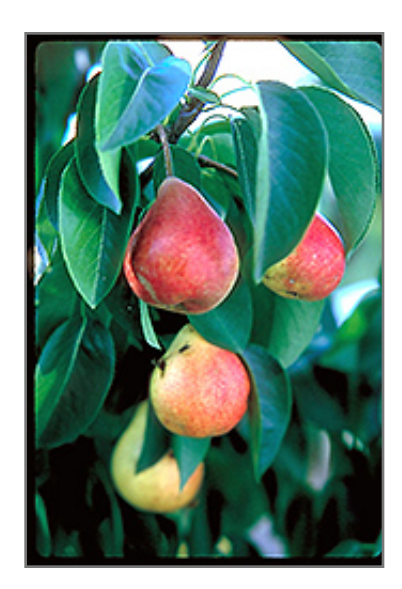
Summercrisp Pear fruit

Summercrisp Pear is clothed in stunning clusters of white flowers with purple anthers along the branches in mid spring. It has dark green deciduous foliage. The glossy oval leaves turn an outstanding burgundy in the fall. The fruits are showy chartreuse pears with a red blush, which are carried in abundance in late summer. The fruit can be messy if allowed to drop on the lawn or walkways, and may require occasional clean-up.