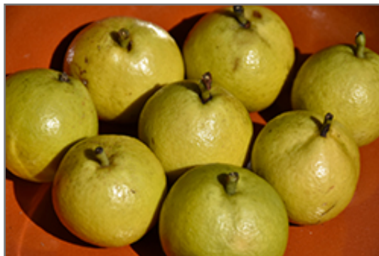
Golden Spice Pear fruit