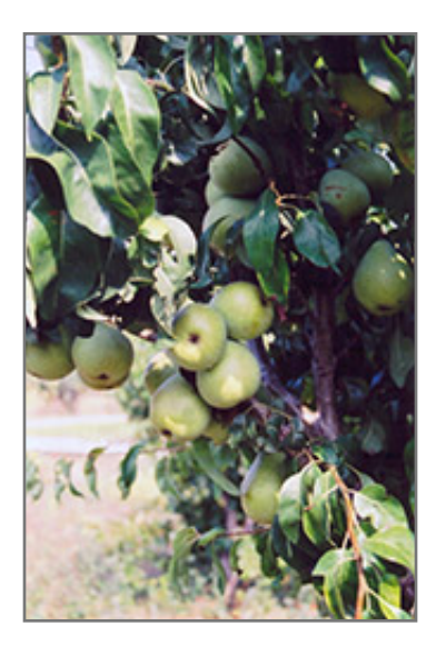
Anjou Pear fruit

Anjou Pear is bathed in stunning clusters of white flowers with purple anthers along the branches in early spring. It has forest green deciduous foliage. The glossy pointy leaves turn an outstanding deep purple in the fall. The fruits are showy green pears with a red blush, which are carried in abundance in early fall. The fruit can be messy if allowed to drop on the lawn or walkways, and may require occasional clean-up.