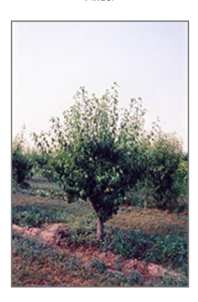
Anjou Pear