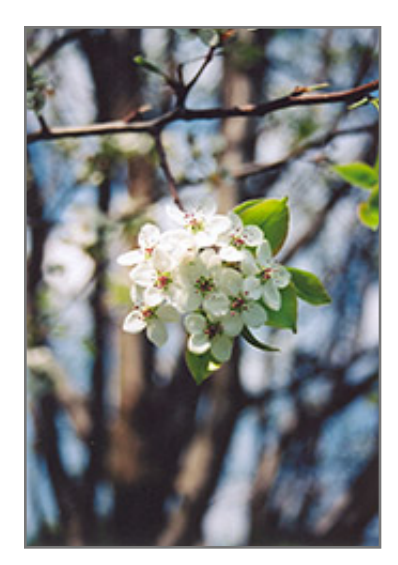
Whitehouse Ornamental Pear flowers

Whitehouse Ornamental Pear is recommended for the following landscape applications;