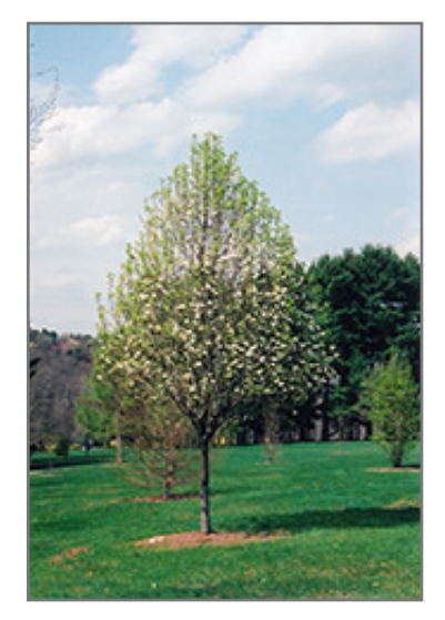
Whitehouse Ornamental Pear in bloom