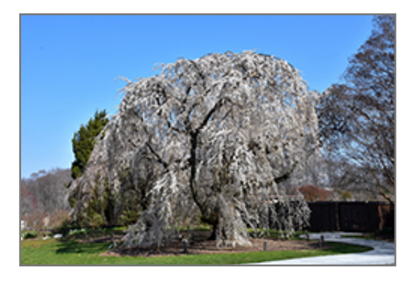
Shidare Yoshino Cherry in bloom

Shidare Yoshino Cherry is a deciduous tree with a rounded form and gracefully weeping branches. Its average texture blends into the landscape, but can be balanced by one or two finer or coarser trees or shrubs for an effective composition.