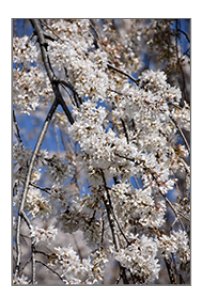
Shidare Yoshino Cherry flowers

This tree will require occasional maintenance and upkeep, and is best pruned in late winter once the threat of extreme cold has passed. Gardeners should be aware of the following characteristic(s) that may warrant special consideration;