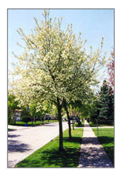
Schubert Chokecherry in bloom

Schubert Chokecherry is a deciduous tree with a more or less rounded form. Its average texture blends into the landscape, but can be balanced by one or two finer or coarser trees or shrubs for an effective composition.