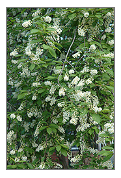
Schubert Chokecherry flowers

This tree should only be grown in full sunlight. It does best in average to evenly moist conditions, but will not tolerate standing water. It is not particular as to soil type or pH. It is highly tolerant of urban pollution and will even thrive in inner city environments. This is a selection of a native North American species.