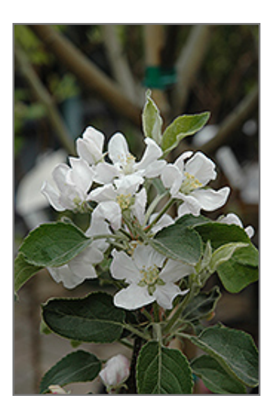
Fuji Apple flowers