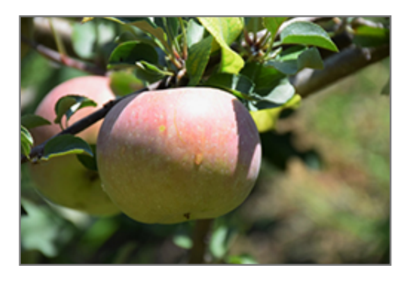
Fuji Apple fruit

Fuji Apple features showy clusters of lightly-scented white flowers along the branches in mid spring, which emerge from distinctive red flower buds. It has forest green deciduous foliage. The pointy leaves turn yellow in fall. The fruits are showy chartreuse apples with a scarlet blush, which are carried in abundance from late summer to mid fall. The fruit can be messy if allowed to drop on the lawn or walkways, and may require occasional clean-up.