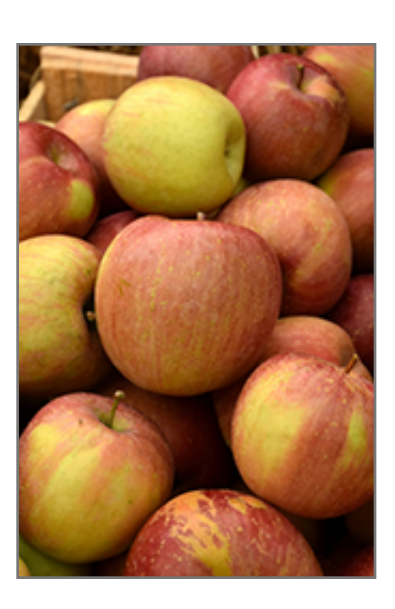
Fuji Apple fruit