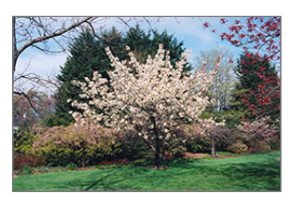
Ukon Flowering Cherry in bloom