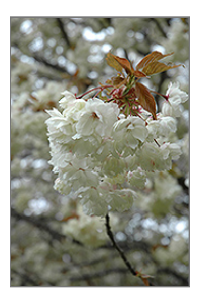
Ukon Flowering Cherry flowers