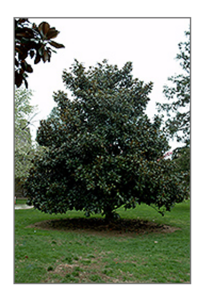
Victoria Magnolia

Victoria Magnolia is recommended for the following landscape applications;