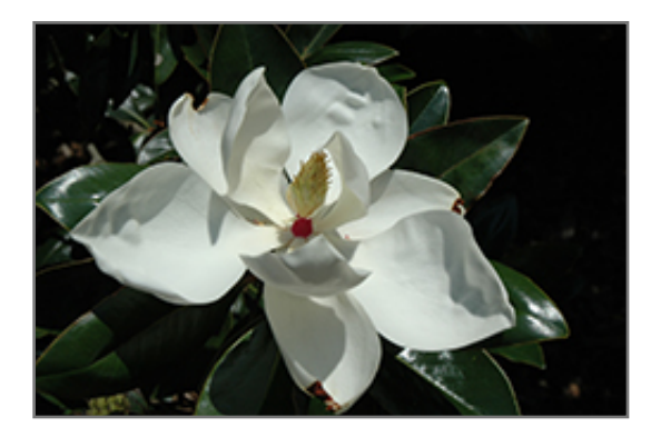
Victoria Magnolia flowers

A beautiful flowering accent tree for home landscapes, smothered in showy and fragrant white cup-shaped flowers in spring through summer; large glossy leaves with rust undersides and a neat pyramidal habit of growth