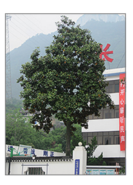
Evergreen Chinese Magnolia

Evergreen Chinese Magnolia is smothered in stunning fragrant white cup-shaped flowers with creamy white overtones held atop the branches from mid summer to mid fall. It has attractive dark green foliage with brown undersides. The large glossy pointy leaves are highly ornamental and turn coppery-bronze in the fall, which persists throughout the winter. The fruits are showy red pods displayed from early to late fall.