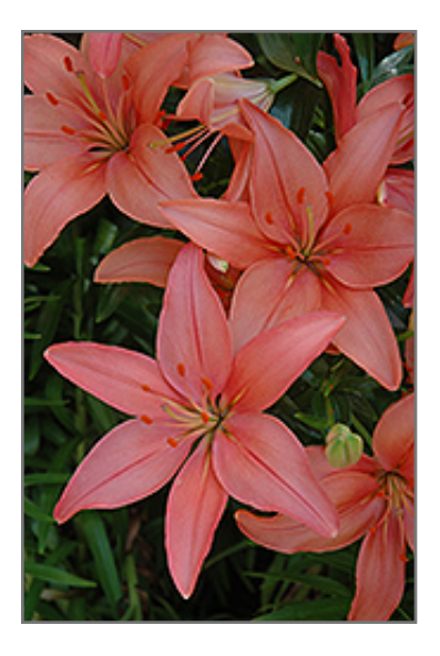
Lily Looks Tiny Toes Lily flowers