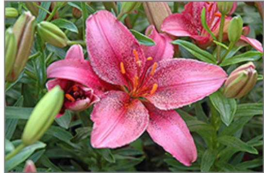
Lily Looks Tiny Spider Lily flowers