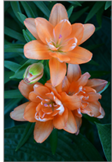
Lily Looks Tiny Double You Lily flowers

Lily Looks Tiny Double You Lily is recommended for the following landscape applications;