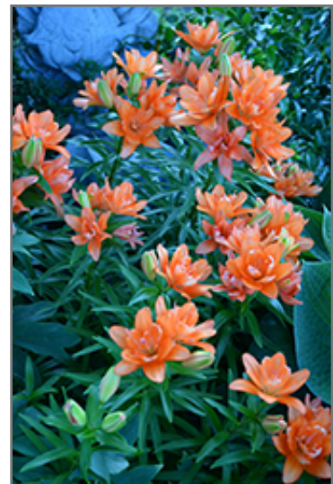
Lily Looks Tiny Double You Lily in bloom