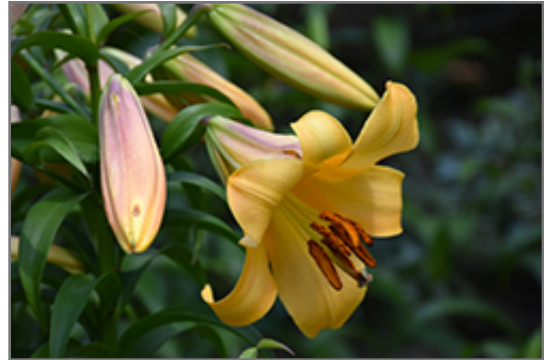
Saltarello Lily flowers