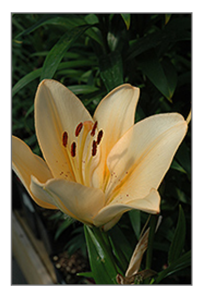
Salmon Classic Lily flowers

An elegant variety bearing large salmon-orange blooms with a gold streak in the midrib; an impressive splash of color, perfect for cutting, containers, and borders