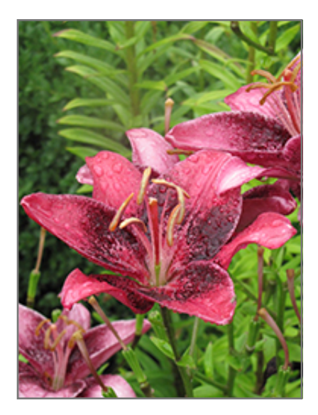
Purple Eye Lily flowers

A stunning variety of lily featuring pink flowers with intense deep purple spotting that fills the center ; an impressive splash of color when massed in the garden or border areas