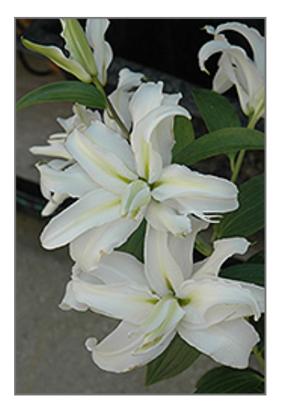
Polar Star Lily flowers

A spectacular double variety with exquisite pure white petals; this variety is a great choice to create focal interest in areas around shrubbery or border plantings